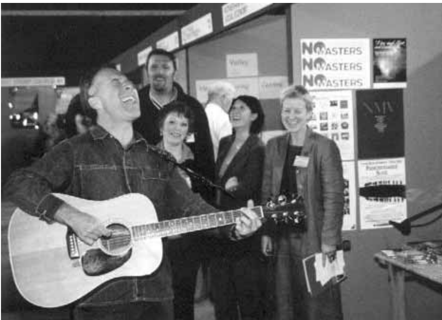
Delegates enjoy live entertainment from 'No Masters' at the FOOTSEY trade fair.

"I would like to place on record my sincere thanks to all members of the Regional Forum for the organisation of 'FOOTSEY 100'. I feel that it was the best event of its kind I have ever attended in the region. The variety of voluntary sector enterprises, the commitment so apparent to all visitors and the willingness to share expertise by all made for a wonderful occasion."